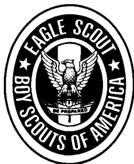
Figure 2 Eagle Rank Badge

From the Scout will be projects, learned while ranks he will to obtain than for the older requirements work for Eagle. Law now have understanding towards Eagle